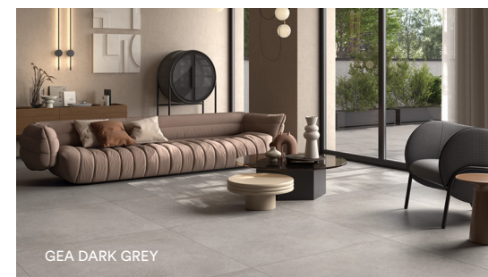
GEA DARK GREY