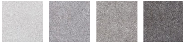
White Grey* Taupe Coal*